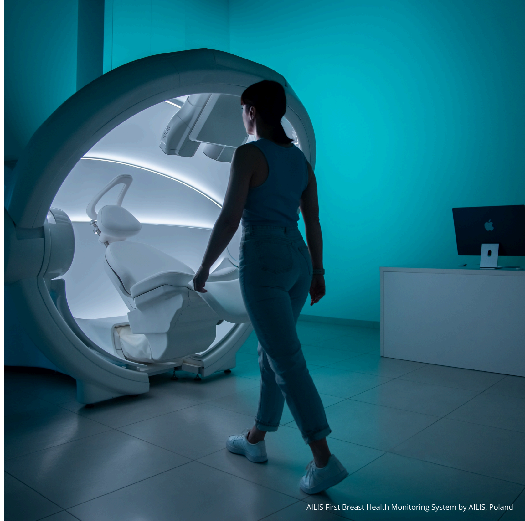
ALLIS First Breast Health Monitoring System by ALLIS, Poland

The EPDA welcomes both up-and-coming designers and renowned design companies to submit their new, innovative and ground-breaking products online to compete for the title Product Designer of the Year.